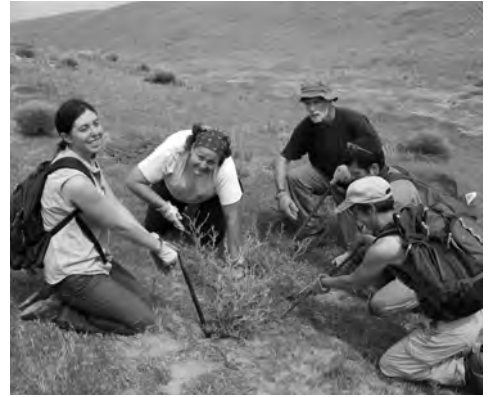
Invasive plant removal is a group project at the Conservancy's Boardman Grasslands. The preserve harbors Oregon's largest viable population of the Washington ground squirrel, listed as endangered under the Oregon Endangered Species Act.

Saturday-Sunday, August 15-16 Remove fences and improve facilities. (Includes painting research station)